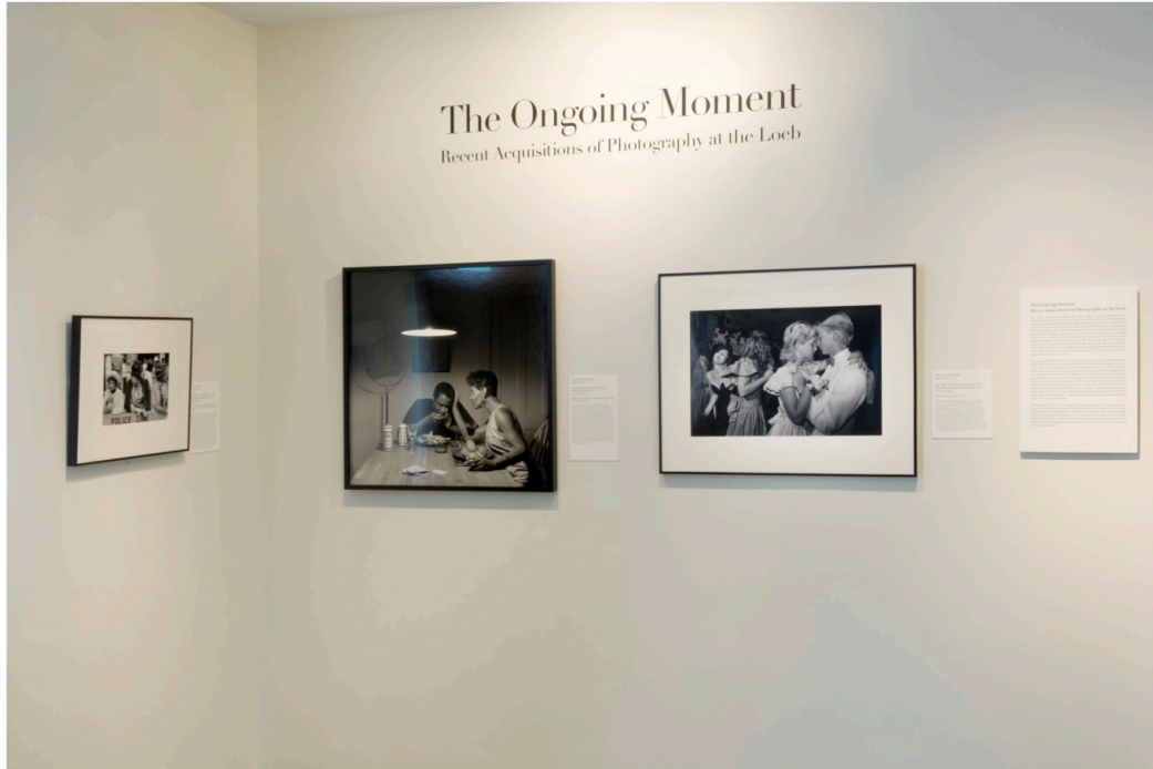
Installation view: The Ongoing Moment: Recent Acquisitions of Photography at the Loeb